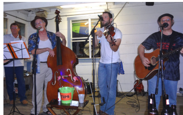
Get Off the Lawn played Shorty's last Saturday night.